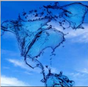
FIRE RESISTANT HYDRAULIC FLUIDS